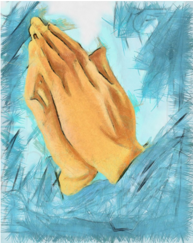
“Pray without ceasing (I Thessalonians 5:17).”